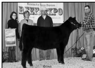
Sib to Lot 31

WHO MADE WHO WOLFRIDGE PEGGY SUE 161X WOLFRIDGE PEGGY 161T (HEAT SEEKER X MEYER 734)