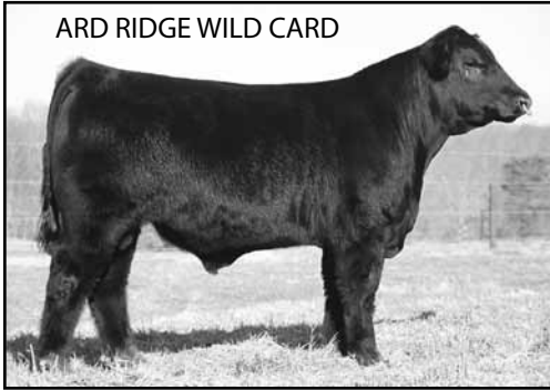
ARD RIDGE WILD CARD DAUGHTERS