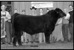
Who Da Man