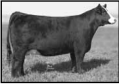
RFG Black Jade

Heat Wave BFSC Hot Like Me RF Black Jade